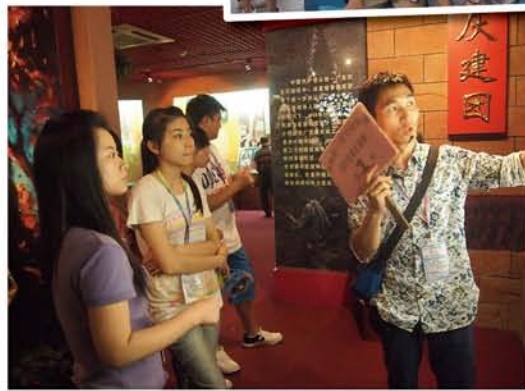
參加者在肇慶閱江樓中，透過圖片資料認識中國在北伐時期的歷史。 Participants learn about the history of China during the Northern Expedition period through a series of pictures at Yuejiang Building, Zhaoqing.