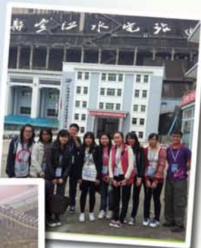
在河源新豐江攔河大壩及水電站，體會大型基建為祖國帶來的貢獻。 Participants witness the contributions of large-scale infrastructures to China at Xinfengjiang Dam and Hydropower Station at Heyuan.

The Association and National Education Services Centre co-organized two sessions of "Liberal Studies Classroom 2012 - Pearl River Delta Study Tour", bringing nearly 240 teachers and students from 18 schools to visit five cities in the Pearl River Delta region. This activity enabled participants to experience the development achievement of the reform and opening up of China and learn about the unique history and culture of Guangdong province.