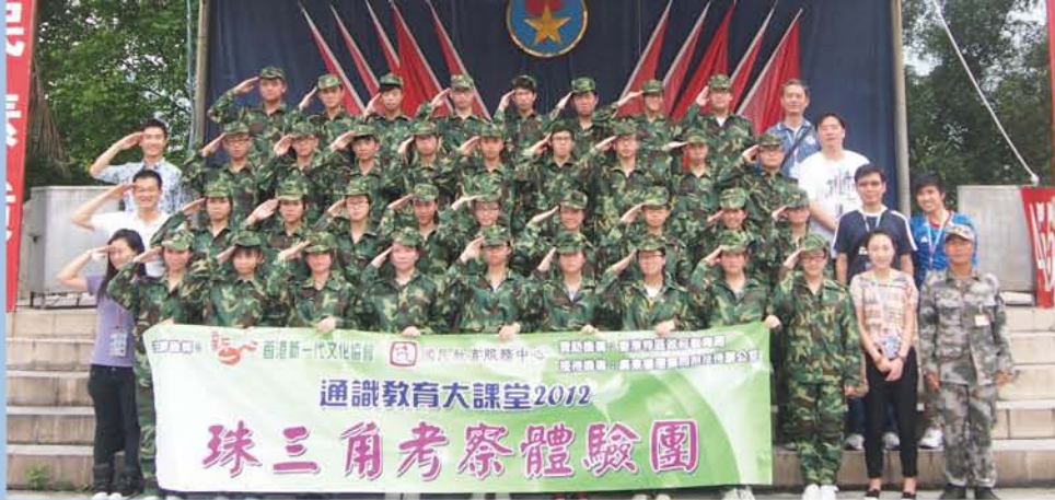
在佛山考察南風古灶，認識當地陶瓷藝術工業的發展歷程。 Participants visit Nanfeng Kiln in Foshan to learn about the development of the local ceramics art industry.