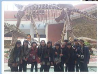
參觀河源恐龍博物館，了解這個中華恐龍之鄉的悠久歷史。 Participants visit Heyuan Dinosaur Museum to learn about the long history of the hometown of dinosaurs in China.