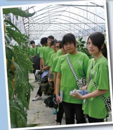
考察惠州永記生態園，認識當地的溫室種植技術。 Participants visit Yong Ecological Park in Huizhou to know about the local technology of greenhouse cultivation.