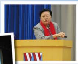
▲ 范徐麗泰大紫荊勳賢擔任到校講座之主講嘉賓。 Fan Hsu Lai-tai, GBM, is invited as one of the keynote speakers of school talks.