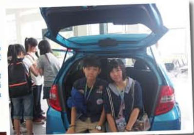
於廣州拜訪廣汽本田的產品展覽廳，了解企業最新型號的汽車產品。 Participants visit the product exhibition hall of Guangqi Honda in Guangzhou to learn about the latest auto model.